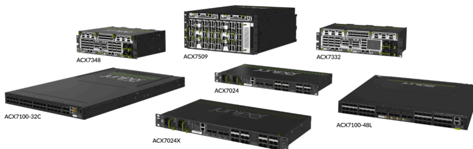
Figure 2. Juniper ACX7000 family—engineered for the IP service fabric of a Juniper Cloud Metro

The advent of small form-factor technologies like QSFP56-DD pluggable optics and 400ZR/ZR+ pluggable transceivers, enables the selection on a port-by-port basis between grey client interfaces (400G LR4) for shorter distances or coherent DWDM interfaces (400ZR/ZR+) for longer distances, as well as transport over an active optical line system—without sacrificing platform density. Juniper integrates QSFP-DD interfaces in its solutions, including the ACX7000 family, enabling considerable capital savings and substantial sustainability benefits for operators compared to the traditional use of external DWDM transponders.